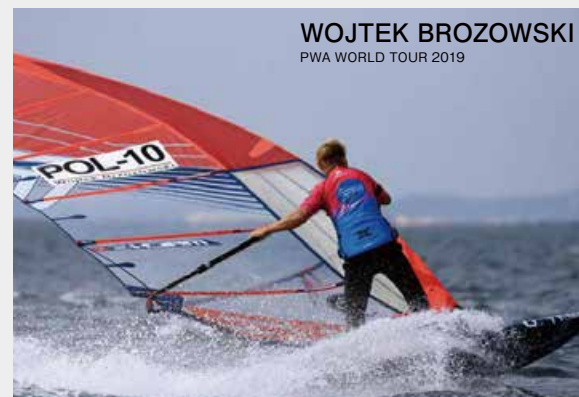
WOJTEK BROZOWSKI PWA WORLD TOUR 2019