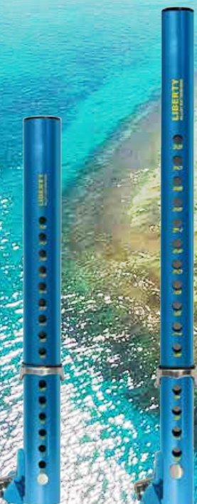
LONG EXTRA LONG