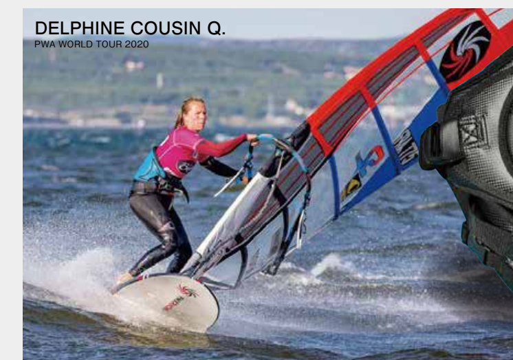
DELPHINE COUSIN Q. PWA WORLD TOUR 2020