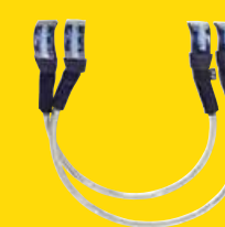
HARNESS LINE FIX