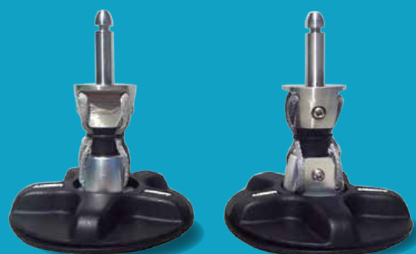
EURO PIN BASE HD NEW!