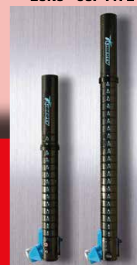
LONG EXTRA LONG