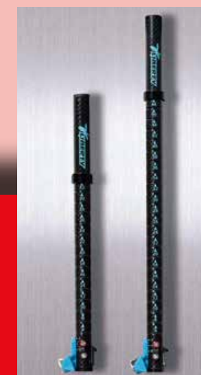
LONG EXTRA LONG