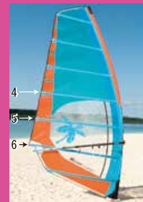
JULIEN QUENTEL PWA WORLD TOUR 2019

* We will ask you each batten full length and tube lengthat at the time of order Example : #5 full length: 230cm Tube: 170cm