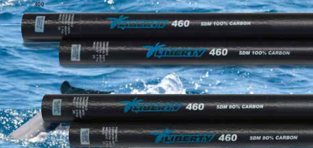
SDM Carbon 100%

Bottom piece hold wind power while top piece flexibly reacts to bluster. LIBERTY SDM carbon mast is able to match-up with various sail by multi bend curves. 100% and 80% are able to purchase bottom and top separately.