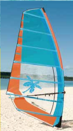
Sailing center in FRANCE

LIBERTY is providing carbon batten to PWA athletes since 2017. They are seeking stability in strong wind condition and more power in light wind condition but those are mutually exclusive. LX7 featured hard and deep tapered carbon batten makes sail form stable which causes wind current smooth in both strong and light wind. Ideal wind current by stable sail form maximize top speed. LIBERTY sail adopts this advanced carbon batten to all sail size.