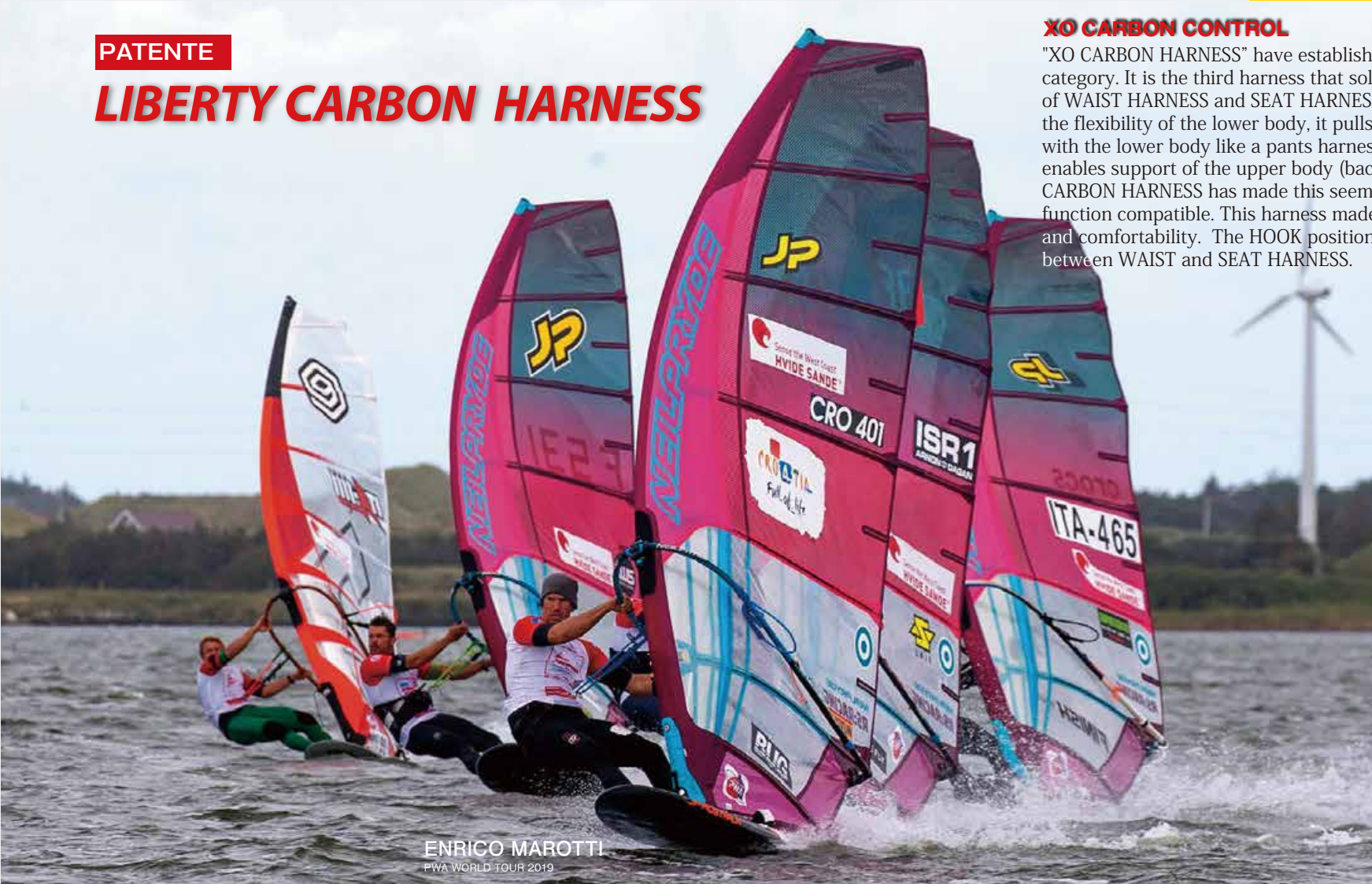
ENRICO MAROTTI PWA WORLD TOUR 2019

"XO CARBON HARNESS" have established a whole new category. It is the third harness that solves the problems of WAIST HARNESS and SEAT HARNESS. While keeping the flexibility of the lower body, it pulls in the sail firmly with the lower body like a pants harness, and it also enables support of the upper body (back). The XO CARBON HARNESS has made this seemingly contradictory function compatible. This harness made efficiency and comfortability. The HOOK position is located between WAIST and SEAT HARNESS.