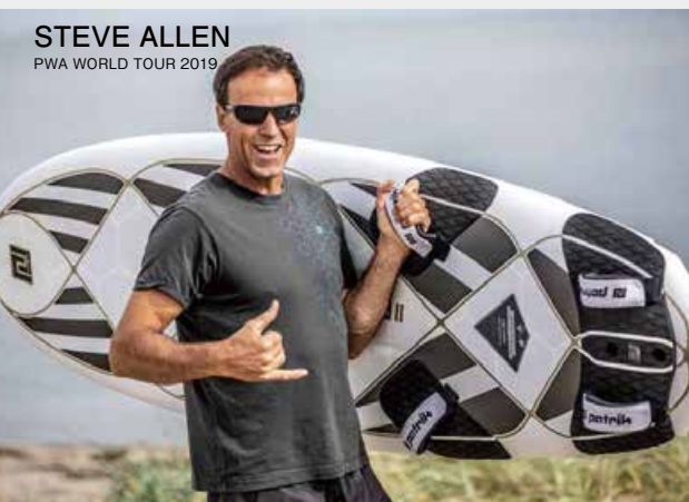
STEVE ALLEN PWA WORLD TOUR 2019