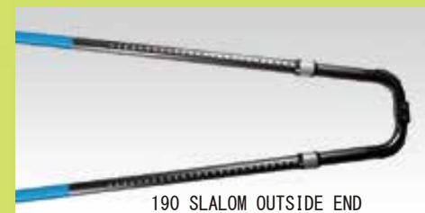
190 SLALOM OUTSIDE END