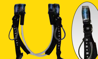
HARNESS LINE ADJ