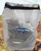
WET BAG LPW 4,000 JPY