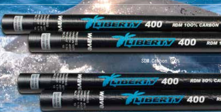
SDM Carbon 100%