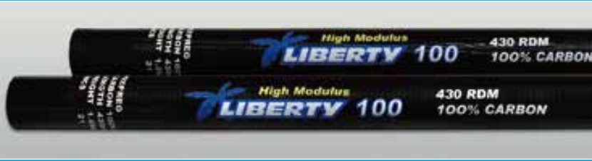
High Modulus Carbon RDM 100%

Further high performance mast! Higher grade carbon named high modulus carbon is used. High modulus carbon brings faster and smooth reaction on strong sudden blow situation with light weight to ensure speed acceleration.