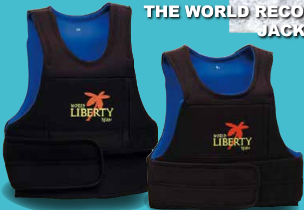
FOR WAIST HARNESS