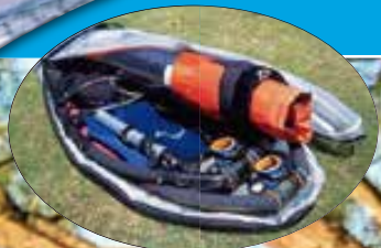
PVC BOOM BAG