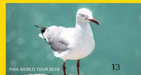
PWA WORLD TOUR 2019

26-36cm TUTTLE 38-42cm DEEP TUTTLE 24-28cm POWER