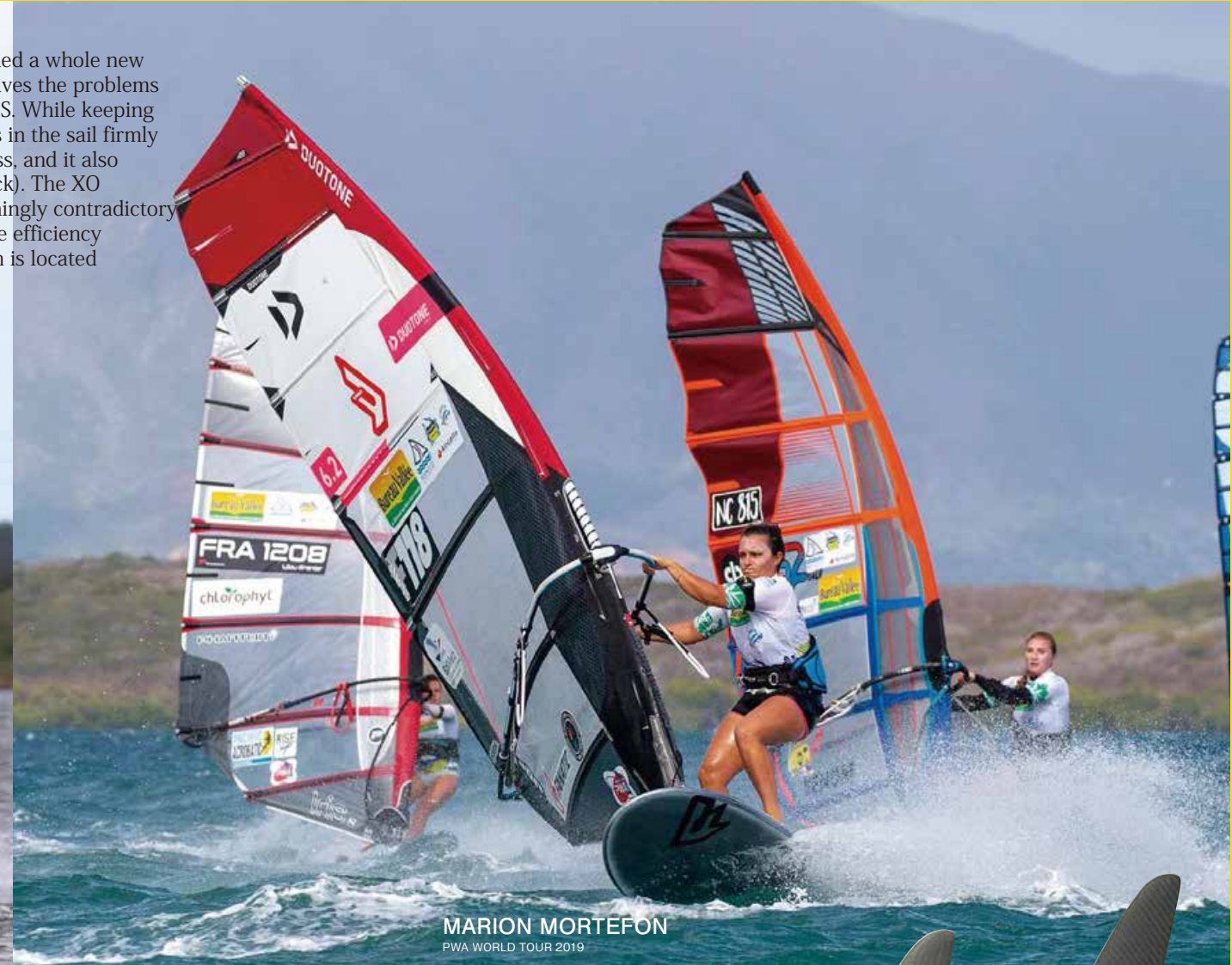
MARION MORTEPON PWA WORLD TOUR 2019