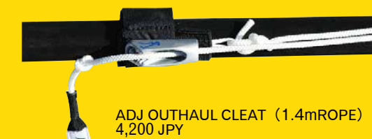
ADJ OUTHAUL CLEAT (1.4mROPE) 4,200 JPY