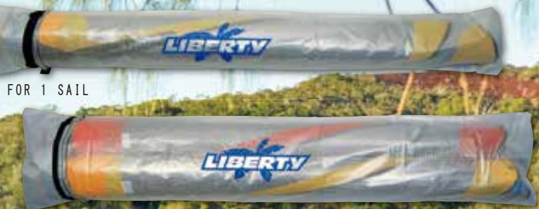
FOR 1 SAIL